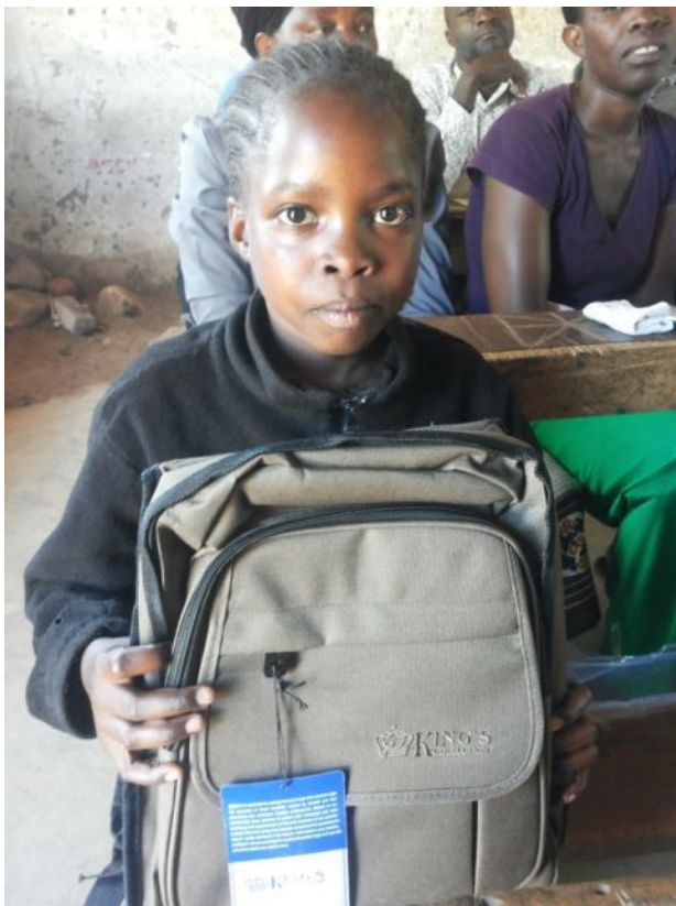
Children admiring some of the items they received