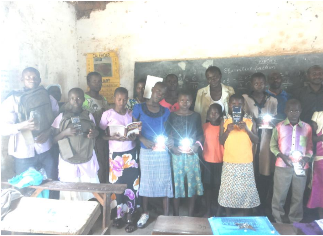
Guardians and children carrying bags, books, solar lamps, mathematical sets etc.