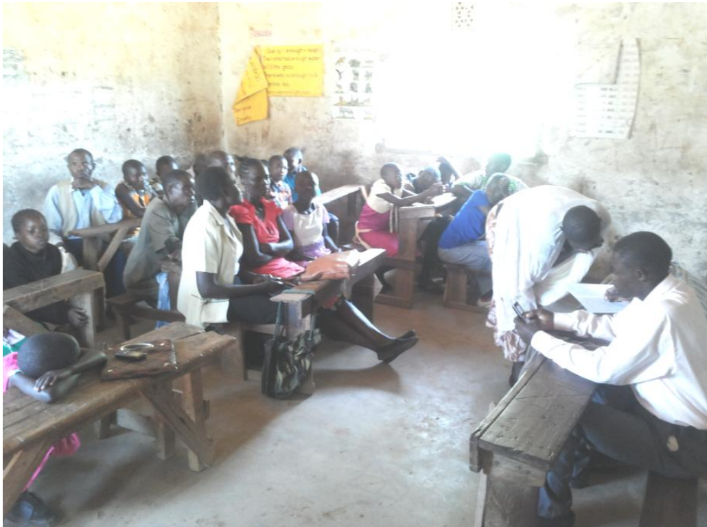
Guardians and children seated in the meeting as the social worker records the items needed by children